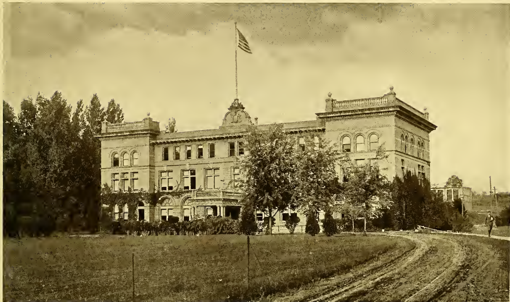
THE NEW YORK STATE VETERINARY COLLEGE